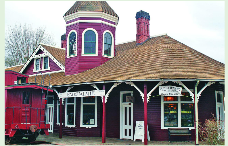
its new exhibition building

City officials expect the museum's popularity to grow in coming years as it builds